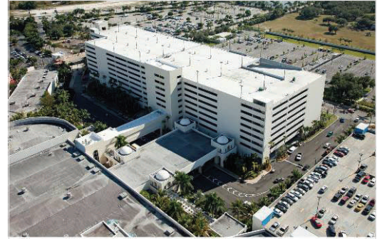
Kraft Construction Seminole Parking Garage & Pedestrian Bridge 12-10-10